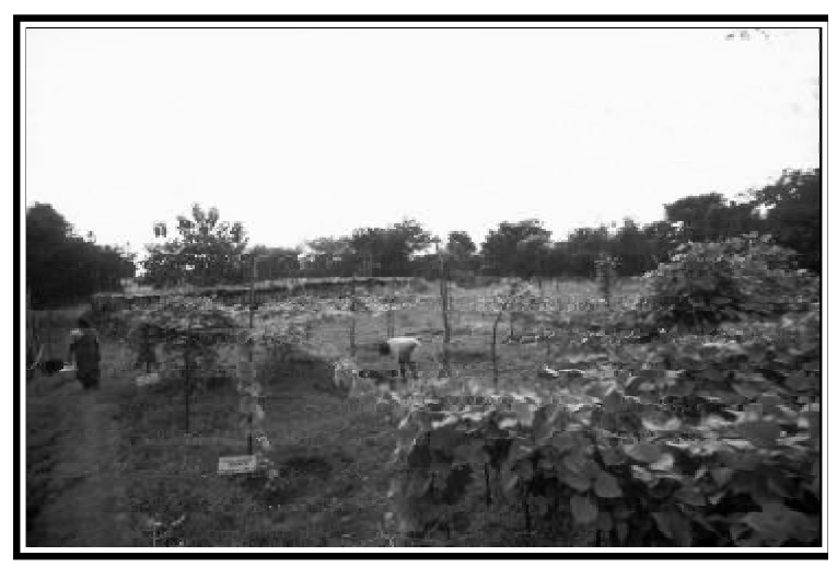
Indigenous Vegetable Conservation Field in Sukkankollai Experimental farm of CIKS