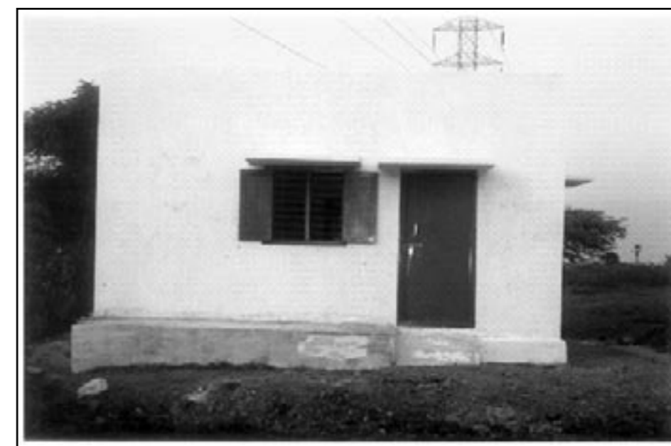
Biopesticide units such as this one are being constructed in a number of villages. Under the HIVOS project, one unit was constructed recently at Vinayaganallur village in Madurantakam taluka.