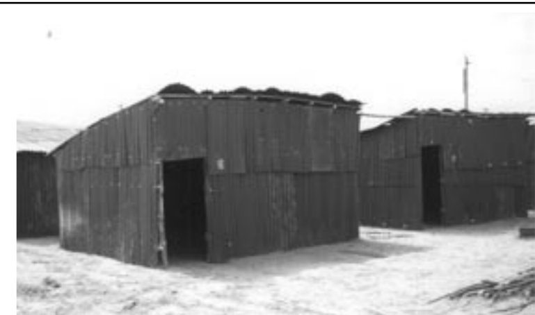
About a hundred shelters such as these have been built and allotted to families in Pudukuppam, near Sirkazhi.

• In the Nagapattinam district we are coordinating with certain relief agencies to identify specific villages in areas where particular needs have been felt as well as carrying out surveys in the affected areas to identify the nature of the need and to assist in the preparation of proposals and request for relief.