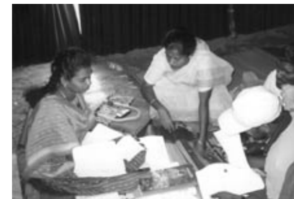
The CIKS staff are involved in collecting data in affected areas to identify the needs of tsunami victims.

It is seen that there is also likely to be some impact of a long term nature on coastal agricultural activities due to reasons such as incursion of salt water in some farming areas and we are currently engaged in a preliminary assessment of this situation. We have also been approached by the Science and Society Division of the Department of Science and Technology which is planning to launch integrated multi sector projects for areas that have been hit by the Tsunami, to participate in their effort.