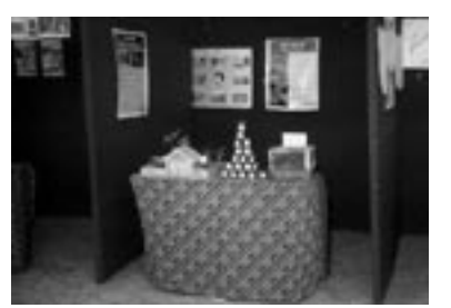
Clockwise, from top left : The Collector arrives; Equipment is distributed to farmers' sangams; Farmers visit the exhibition; An exhibition stall displaying seeds; The hall is packed to capacity; Women farmers arrive by truck.