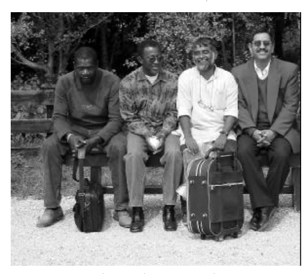
Compas Regional Coordinators at the IMM Meeting

gramme for research, action and publications during the current phase. It was also agreed that during the initial period of this phase the partners would each undertake a "Community diagnosis" of Indigenous resources in their respective field areas. This would serve as a guideline for planning the field work by the partners for the Compas programme from January 2004 onwards.