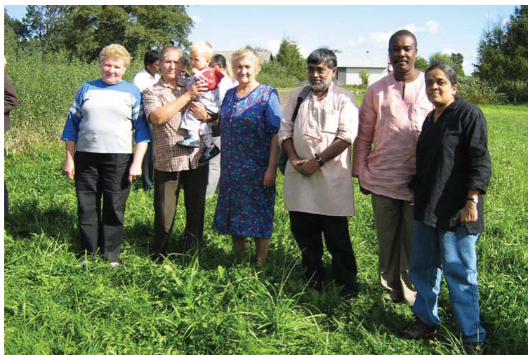
Compas partners visiting a farmer near Lezajsk cultivating willow