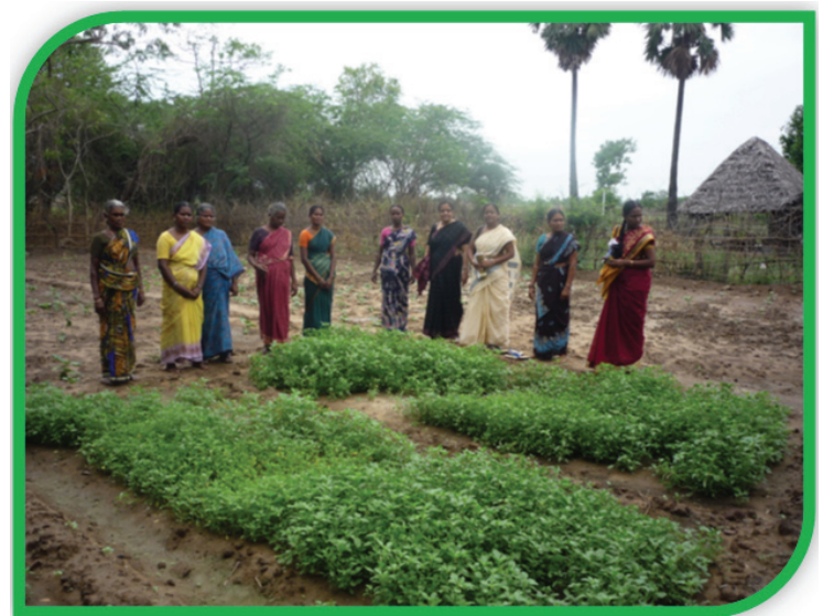
Members of the Ponni Women's Group in the Community Kitchen Garden

A community kitchen vegetable garden has been established in Aadhamangalam village of Nagapattinam district. The main objective of this effort is to create awareness on nutritional security, conserve indigenous vegetable varieties and to improve the community spirit. This community kitchen garden established in 10 cents is being maintained by the Ponni organic farming women's group. Technical support in the form of trainings, regular visits to the garden as well as inputs like quality seeds of different indigenous vegetable varieties have been provided by CIKS. The entire stretch of activities likes weeding, watering, preparation and use of biopesticides and compost, harvesting etc. are taken care of by the women's group. This community kitchen garden also serves as a demo vegetable garden for the people in and around Aadhamangalam village. Many women in the village have started raising their own kitchen gardens. This is one of main impact achieved through this effort.